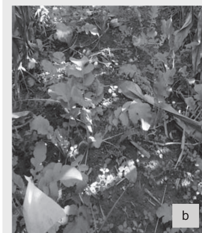
Annual ryegrass (a) and Tillage Radish® (b) interseeded in corn in June. Photos taken in October.